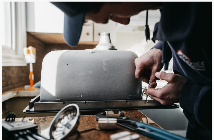
Plumbing Repair Services Saskatoon