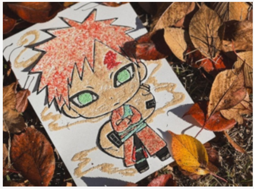
Dearticipants can take home one-of-a-kind sand art

challenged with skillfully manipulating a variety of colored sand to create a one-of-a-kind piece of art for guests to take home as a souvenir.