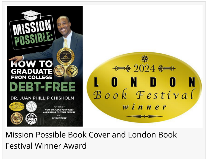
Mission Possible Book Cover and London Book Festival Winner Award

Receiving an award or being recognized by the London Book Festival as a Winner, Runner-Up, or Honorable Mention is an incredible honor and impressive achievement for any author to receive