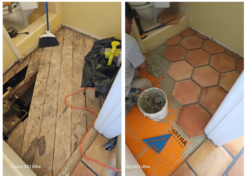
Bathroom Remodeling and Tile Installation