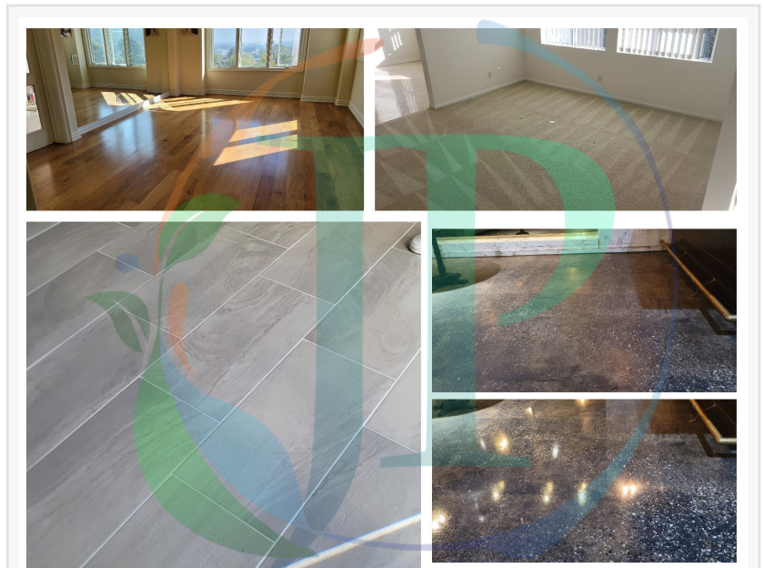
Services JP Carpet Cleaning

Increased Property Value: A remodeled bathroom is a significant asset that boosts the appeal of