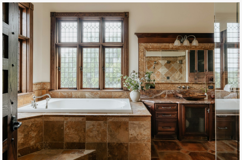
Valley Village Tile and Grout Cleaning | JP Carpet Cleaning Expert Floor Care

Tile floors are a staple in many homes, appreciated for their durability and elegance. Yet, without proper maintenance, these surfaces can lose their charm due to the buildup of dirt, grime, and bacteria, particularly in grout lines. The article addresses this common problem, explaining how professional cleaning services can rejuvenate tiles and grout, restoring their original appeal and extending their lifespan.