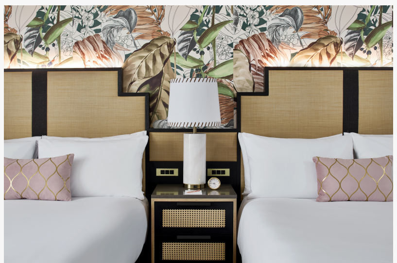
La Concha Key West Queen Queen Guest Room

La Concha draws its inspiration from a strong literary heritage, where prominently renowned writers Ernest Hemingway and Tennessee Williams often walked its halls. Throughout La Concha, guests find books in their rooms and a library in the lobby encouraging literary exploration. All guest rooms are equipped with a journal and pen encouraging guests to document their time in Key West like Hemingway did.