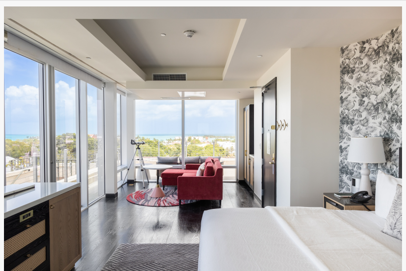
La Concha Key West Grand Dame Villa

scale redesign and reinvigoration as the entire seventh floor of La Concha Key West now consists of seven rooftop villas, as a new, concierge-level experience designed to indulge guests with unexpected luxuries and signature hospitality. Each villa – personalized to its namesake – offers a grand respite, boasting floor-to-ceiling windows and balconies with stunning views, and a dedicated Lifestyle Concierge to assist with all guest needs.