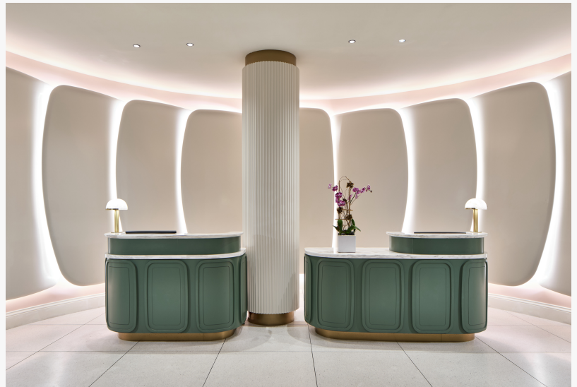
La Concha Key West Lobby