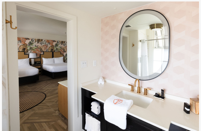
La Concha Key West Guest Room Bathroom

The new hotel villas - the Grand Dame Villas at the Rooftop - are a piece of the property's large-