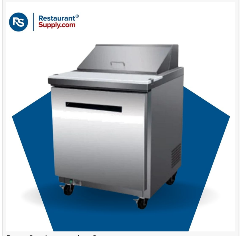
Prep Station on the Go