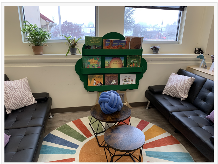
CAHS Community Room

Capital Area Head Start has plans to hold workshops for parents and