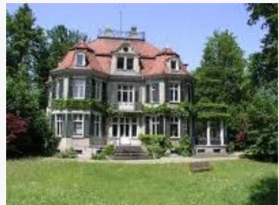
Home of wds in Winterthur