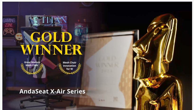
AndaSeat AWARD TITAN 2024