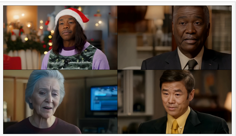
A collection of AuRA-Generated Emotive Avatars

SONORA, CA, UNITED STATES, December 11, 2024 / EINPresswire.com/ -- Big Blue Ceiling today announced the upcoming release of the AuRA Avatar Generator, a groundbreaking companion to the AuRA Autonomous Research Assistant platform. The AuRA Avatar Generator