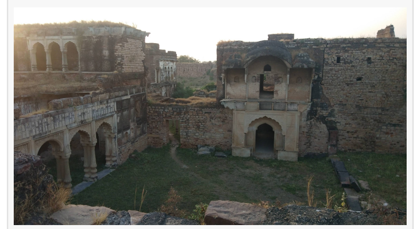
Gohad Fort - won the UNESCO Asia-Pacific Award for Cultural Heritage Conservation in 2017

remained a key military asset throughout its history, with Scindia's forces taking control of it in the latter half of the century. The fort is surrounded by eight bastions and a protective moat, with two main entrances: the Ghati Darwaja and Singh Paur. The Darbar Hall, built in 1937, is a stunning feature, offering a glimpse into the royal lifestyle of the time.