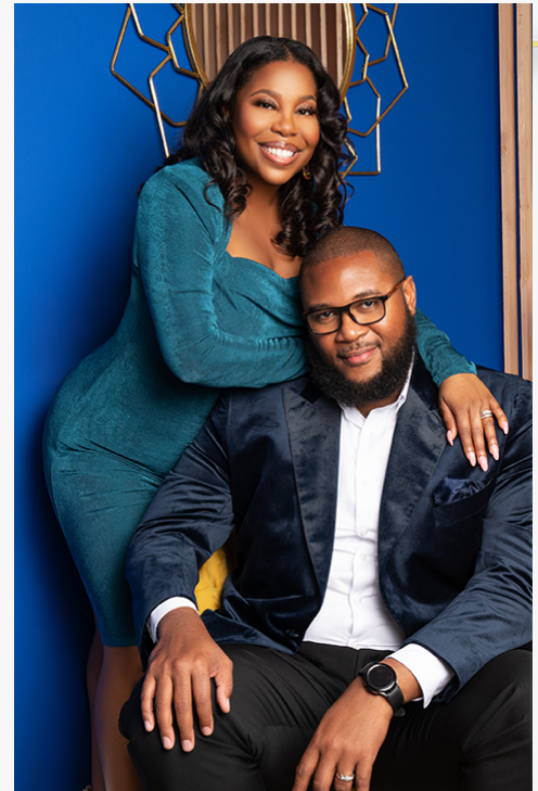
King and Queen

The Cancun Marriage Retreat offers a unique blend of growth, connection, and luxury, tailored to help couples build stronger marriages. Through intentional workshops on communication, financial alignment, and shared goal-setting, participants leave feeling more united and aligned with their partner. The retreat strikes a perfect balance between enriching activities that strengthen bonds and moments of quiet reflection for relaxation and renewal. With all-inclusive accommodations, private airport shuttles, and airfare included, couples can focus entirely on their experience without the stress of logistics. Surrounded by a supportive community of Black