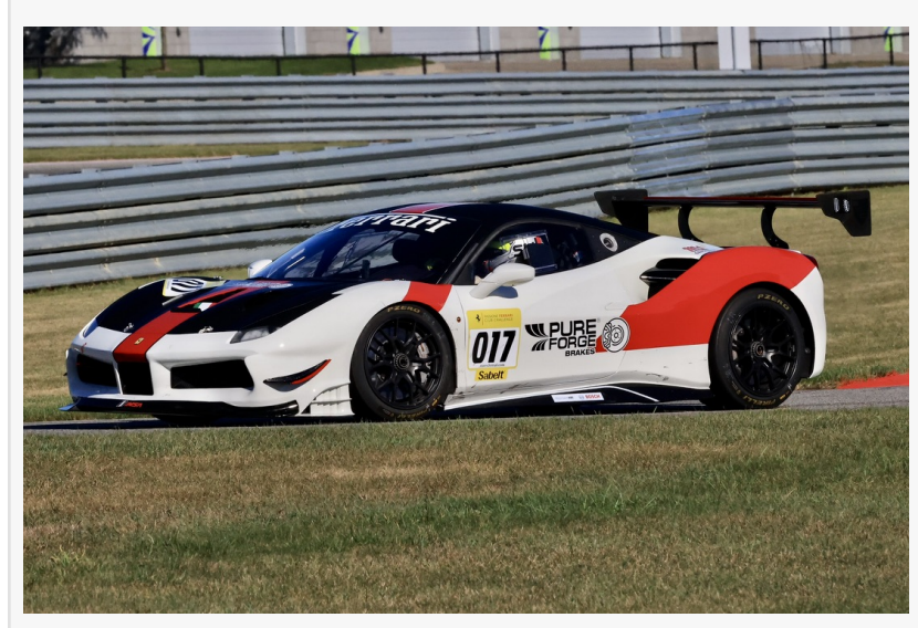
Calaro's 488 Ferrari Challenge Car