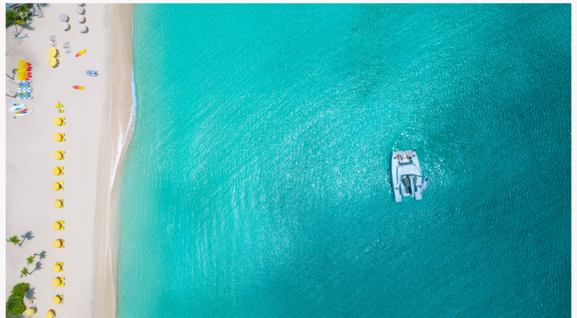
Anguilla is known for her spectacular beaches