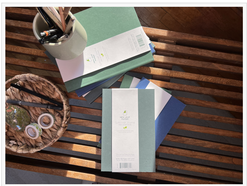
Beautifully embossed, solid-color made with 100% post-consumer recycled fiber. Perfect for everyday use, these journals are vegan, made in the USA, and printed with eco-friendly vegetable inks

Impact showcases products from <u>Certified B Corporations</u> that prioritize environmental and social responsibility. New Leaf Paper's inclusion in this guide for the second consecutive year underscores its dedication to producing high-quality, sustainable products that resonate with conscious consumers.