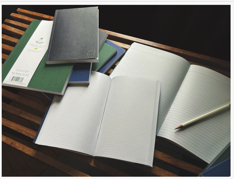
With 192 lined or dotted pages made from 100% recycled fiber, these durable, eco-friendly journals are ideal for mindful notes, schedules, or creative ideas

About New Leaf Paper, Inc. New Leaf Paper is a national leader in environmentally responsible paper solutions, specializing in high post-