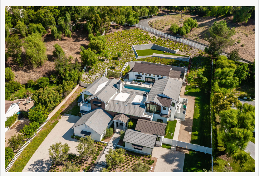
Stunning modern estate in prestigious Hidden Hills

chef's kitchen includes a massive island, professional appliances, and a hidden secondary kitchen. With six bedrooms, 11 bathrooms, and direct patio access, the home offers luxurious spaces for relaxation or enjoying the waterfall pool.