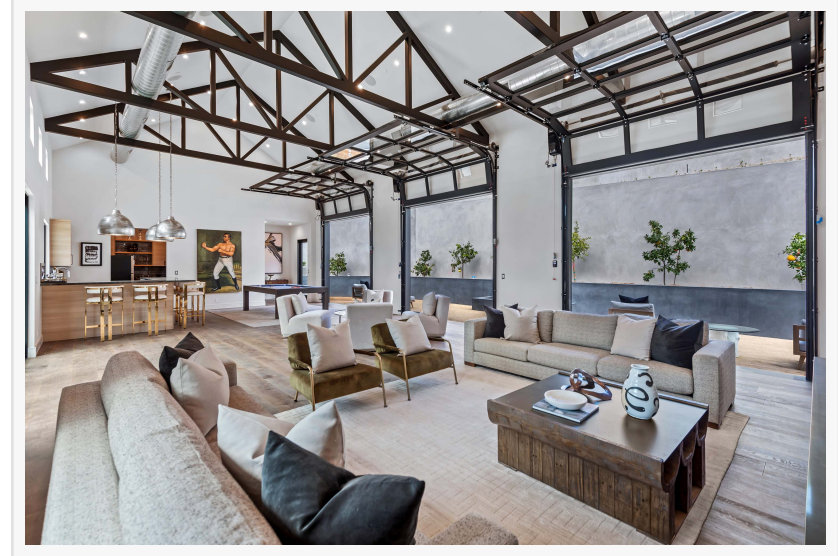
Versatile party barn with commercial-grade amenities