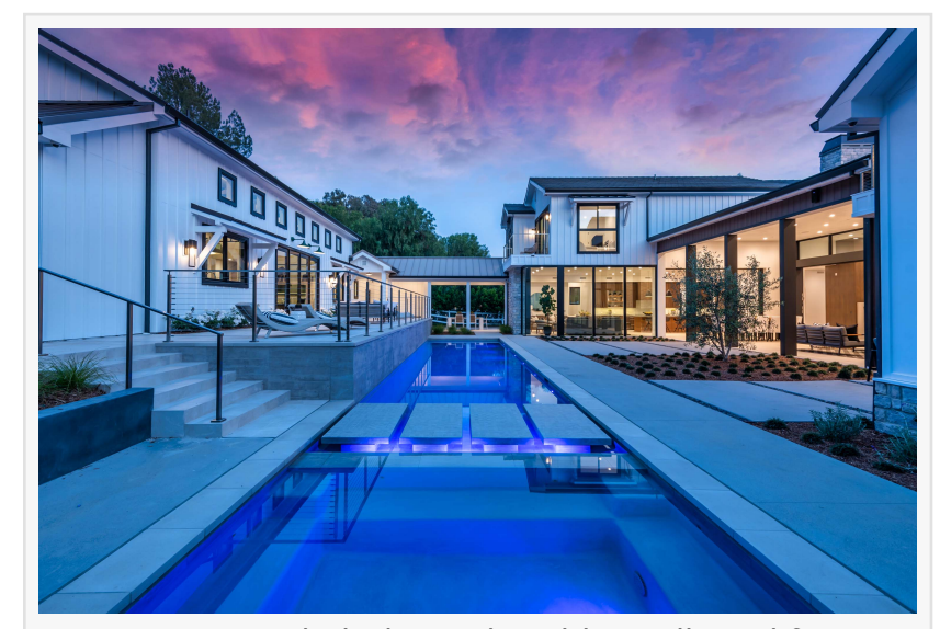
25057 Lewis and Clark Road, Hidden Hills, California

Set on 1.22 acres, 25057 Lewis and Clark Road is a nearly 9,000-square-foot modern retreat featuring stone and glass architecture with open-concept interiors, vaulted ceilings, and over 40 feet of Fleetwood pocket doors for seamless indoor-outdoor living. The