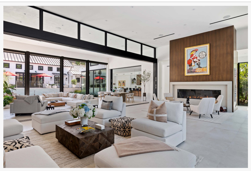
Expansive 9,000 sq.ft. home on 1.22 acres

Hidden Hills, a prestigious Southern California enclave, is home to A-list celebrities and athletes, offering advanced security with gated access, 24-hour patrols, and Al-enhanced fire protection. Nestled in the Santa Monica Mountains, 25 miles from Beverly Hills, this exclusive community features three horse arenas, 25 miles of trails, and a charming bucolic