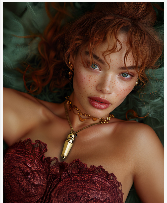
The 24k gold-plated Potion Pendant worn as a necklace, blending timeless elegance with modern sophistication by Maison Potion.