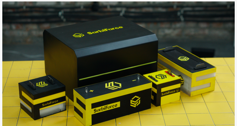
SorbiForce line up of safe sustainable batteries