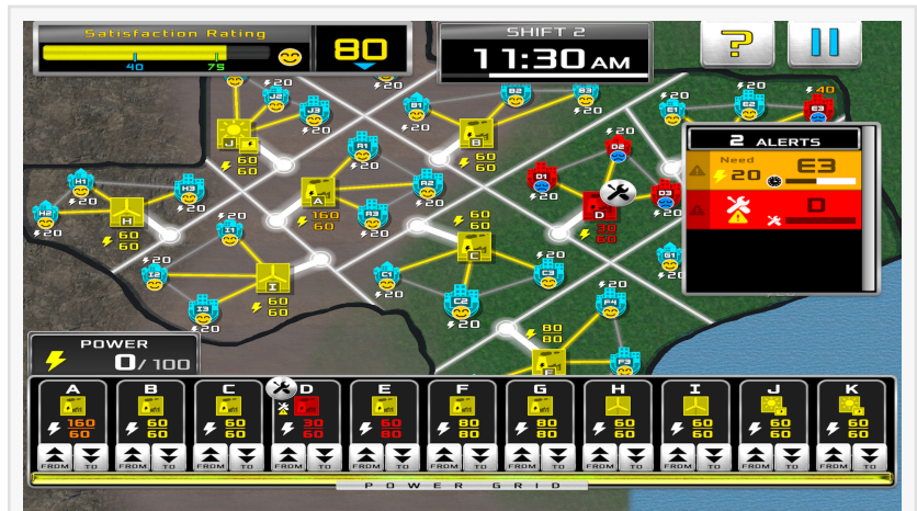
Texas PowerGrid Challenge Screenshot