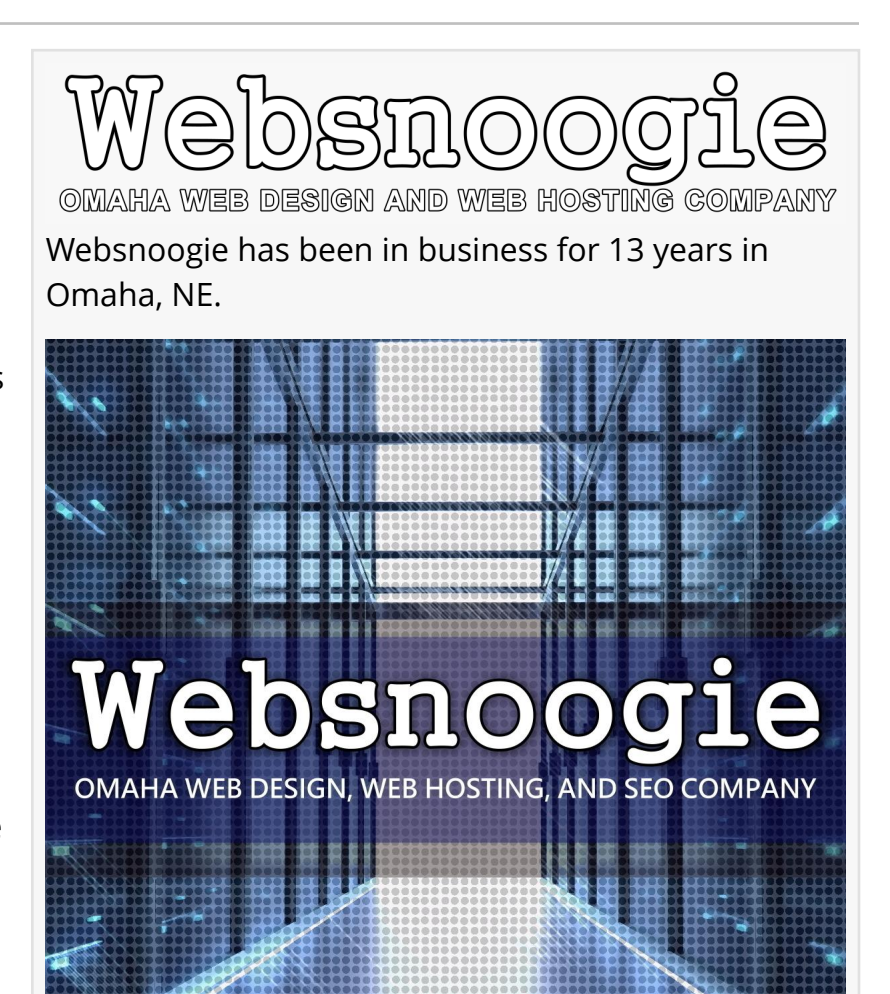
Websnoogie is an enterprise web hosting and web design company.

Tailored Solutions for Small Business Growth