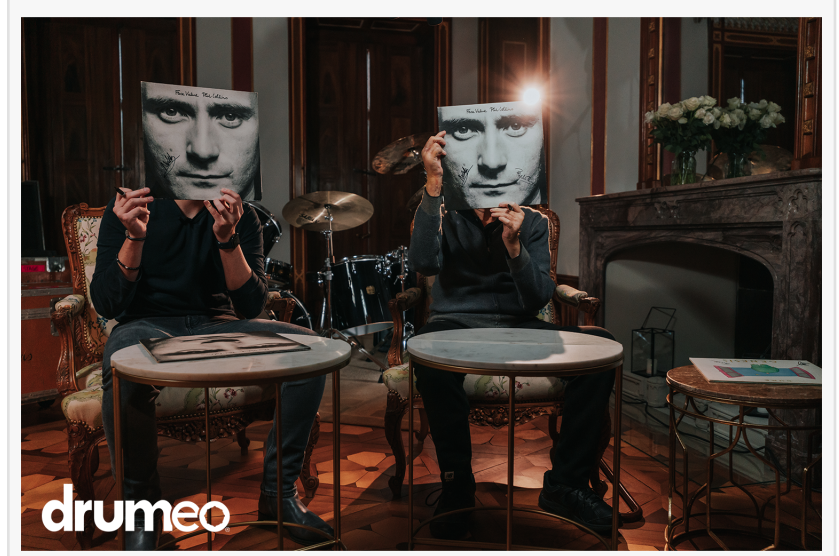
Pictured: Phil and son Nic with 'Face Value', the debut solo studio album by English drummer and musician Phil Collins

This press release can be viewed online at: https://www.einpresswire.com/article/768272659