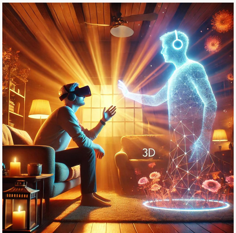
This AI-generated image illustrates OPIC Technologies' innovative 3D livestreaming technology, fostering connection and combating loneliness through immersive experiences..

OPIC Technologies, Inc. is the global leader in 3D livestreaming technology, delivering immersive