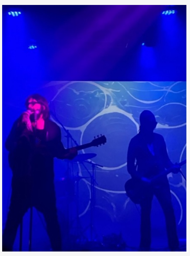
Firouz FarmanFarmaian