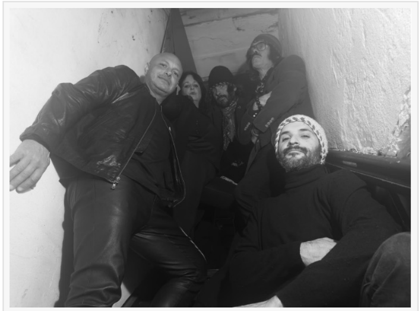
FORRM: (Photographer Credit: We R The Nomads 2024)

NEW YORK, NY, UNITED STATES, December 12, 2024 / EINPresswire.com/ -- Firouz FarmanFarmaian presents a string of new works storming Manhattan in a week-long multi-event in NYC, starting with the American and New York debut of experimental rock outfit, FORRM's new album GALACTICA. The album due to be released in 2025 is strongly influenced by both 1960's and 1990's independent rock and tribal performative explorative psychedelia.