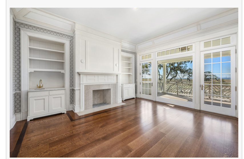
Luxurious interiors with 7,736 sqft, five fireplaces, and bespoke finishes

services company in the United States, Concierge Auctions continues to operate independently, partnering with real estate agents affiliated with many of the industry's leading brokerages to host luxury auctions for clients. For Sotheby's International Realty listings and companies, Concierge Auctions provides Sotheby's brand exclusivity as Sotheby's Concierge Auctions. Since inception in 2008, the firm has generated billions of dollars in sales, broken world records for the highest-priced homes ever sold at auction and sold properties in 46 U.S. states and 35 countries. The firm owns one of the most comprehensive and intelligent databases of high-net-worth real estate buyers and sellers in the industry, and it has committed to build more than 300 homes through its Key For Key® giving program in partnership with Giveback Homes™, which funds new homes for families in need from every property the company sells. For more information, visit ConciergeAuctions.com.