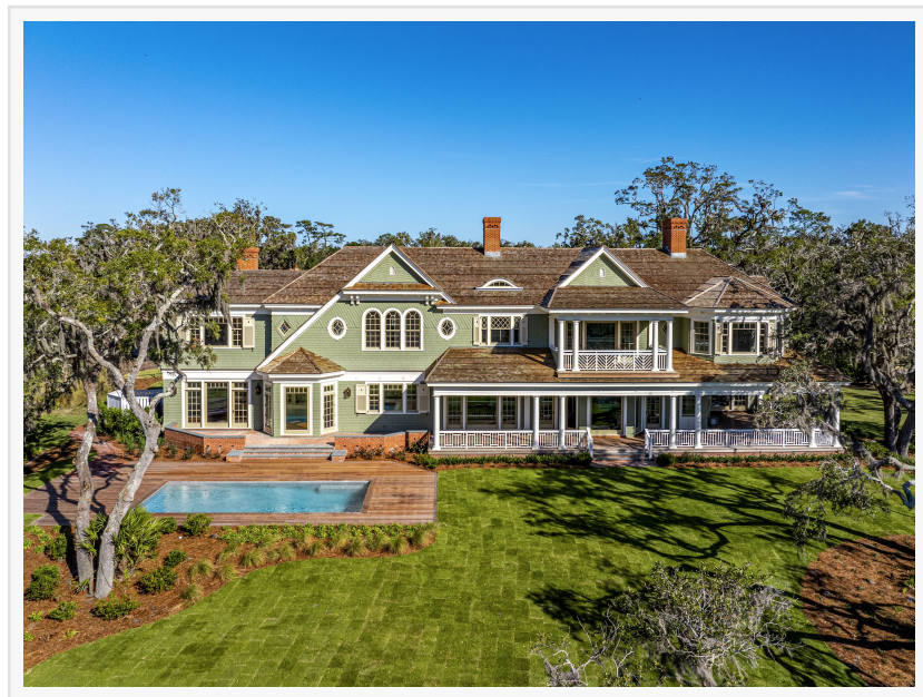
'The House on King's Point', 144 Point Lane, Saint Simons, Near Sea Island, Georgia

Located near the prestigious Sea Island community with application rights to the club, the extraordinary property will be offered in cooperation with