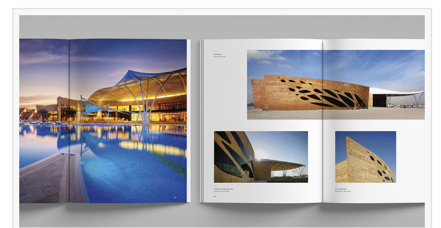
Paolo Lettieri Monography Abu Dhabi Ladies Club

The curators' choice was to catalogue the projects following a functional criterion: each chapter of the book describes a theme addressed by the architect for the construction of buildings dedicated to different functions such as healthcare, education, hospitality or residence. The introduction to each individual design theme is entrusted to a text in the form of a dialogue between Paolo Lettieri