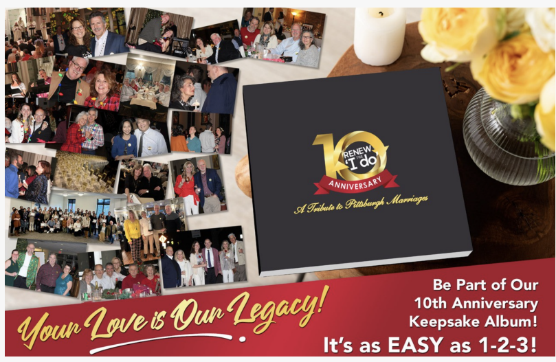
Renew The I Do Foundation celebrates marriage with new keepsake album

offering coaching, training, and certification in story facilitation. Their strategy T-Squared: (Transaction × Transformation) empowers leaders to meet goals, see differently, and create meaning through authentic communication and connection.