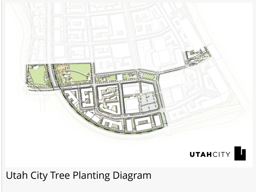
Utah City Tree Planting Diagram