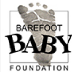
Barefoot Baby Foundation Logo