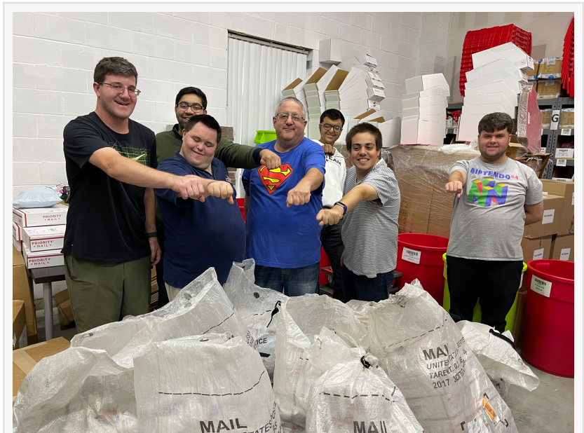
John and Team

This press release can be viewed online at: https://www.einpresswire.com/article/768533356