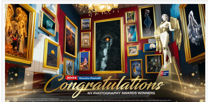
2024 New York Photography Awards Full Results Announced

EINPresswire.com/ -- The International Awards Associate (IAA) proudly announces the winners of the 2024 New York Photography Awards . This global competition recognizes outstanding photographers worldwide, honoring their creative vision and dedication to capturing impactful moments through photography.