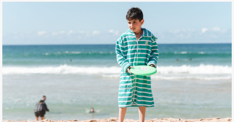
Beach Towels for Kids

SYDNEY, NEW SOUTH WALES, AUSTRALIA, December 13, 2024 /EINPresswire.com/ -- Zippy Kids, an Australian brand known for its innovative hooded towels for children, has launched a new website designed to provide parents with seamless access to their range of high-quality products. The platform features a variety of options, including the popular kids hooded beach towel , aimed at keeping children warm, dry, and comfortable year-round.