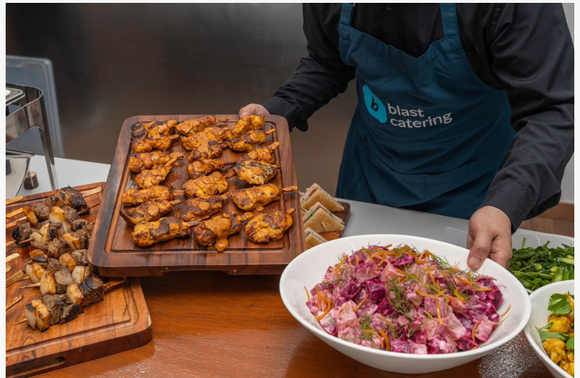
Blast Catering Full Service Buffet