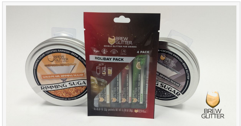
The Brew Glitter 'Holiday Pack' for drink glitters, now in Michaels stores.

In March 2023, the Michaels.com marketplace got a massive overhaul. Michaels invited Brew Glitter to be a trusted vendor on the revamped store, providing our complete line of products to their catalog. Since then, Brew Glitter has served its signature products to countless online