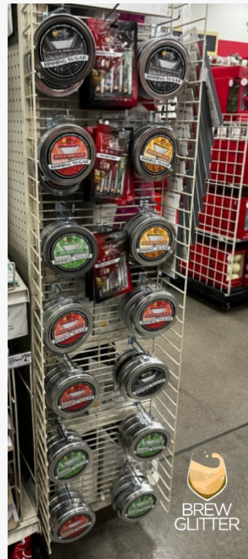
Brew Glitter products in Michaels retail stores.