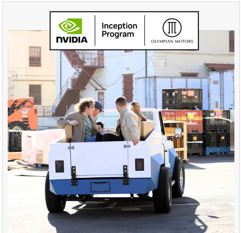
Inception Program by NVIDIA and Olympian Motors - Model 84