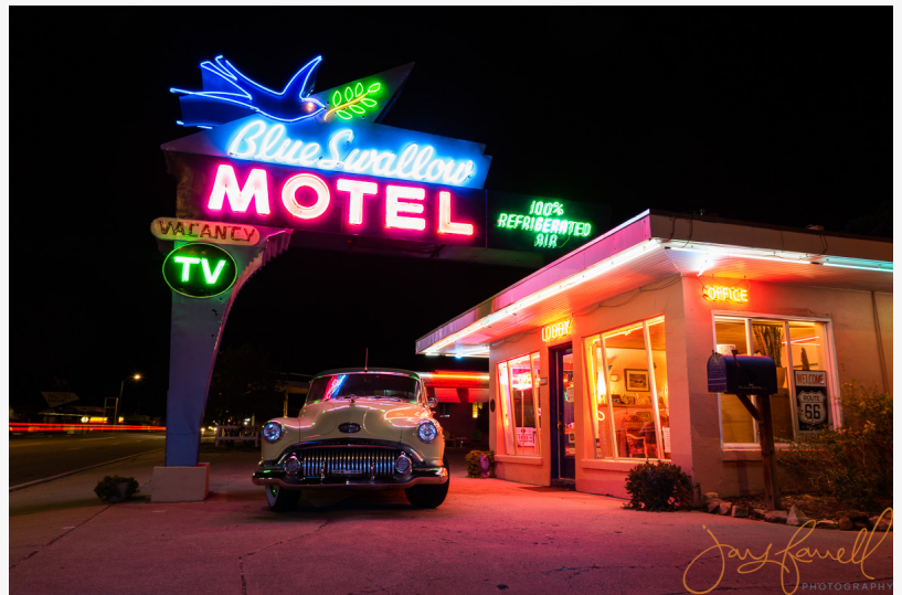
Route 66 legend

This beautifully printed 8.5" square hardcover book transports readers on a visual journey along America's most iconic highway, featuring vibrant photographs and stories from the road.