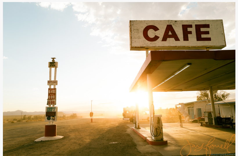
Roy's Motel & Cafe Amboy, CA.