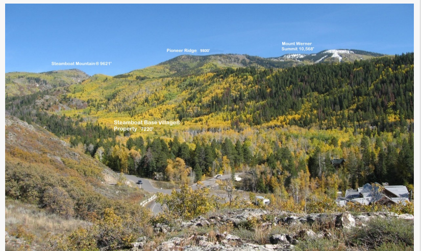
Steamboat Base Village® - Autumn

Steamboat is the largest ski area in the world that utilizes a single ski base portal to accommodate an estimated 1.4 million skiers annually, an average of over 10,000 skiers daily. The IKON pass and Steamboat's two gondolas have dramatically increased the number of skiers at Steamboat. Steamboat's single base ski area is an abnormality for the second largest ski area in Colorado. The addition of the Steamboat Base Village® would add a second entrance to the ski area from the North for quick access to the ski area and its elite ski terrain.