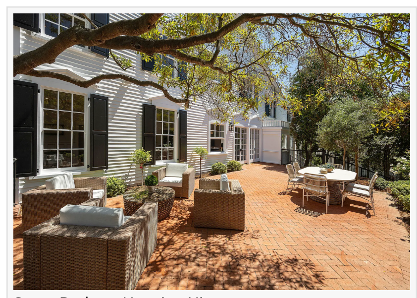
Santa Barbara Housing History

The publication provides a detailed review of Santa Barbara's transformation from its early days as a Chumash settlement to a Spanish colonial hub, and finally, a modern city with a blend of historical and contemporary influences. Readers will explore the evolution of housing styles,