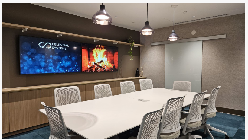
New Global Headquarters in Vancouver highlights Celestial's strong Canadian focus

As part of its continued growth and commitment to innovation, Celestial Systems is excited to announce the opening of its new Global Headquarters in Vancouver, Canada. This state-of-the-art nearshore delivery center will enable Celestial to consult with, strategize, build, implement, and deliver cutting-edge digital technologies and future-forward solutions for leading financial services and technology companies.