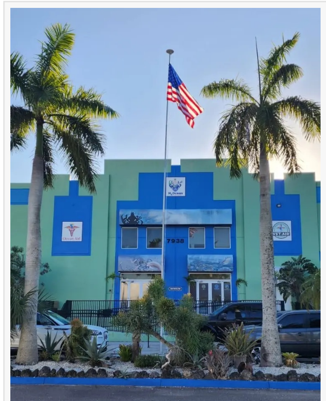
H2Ocean Headquarters, Stuart, Florida, USA

Post-Op Care is the Cornerstone of Patient Satisfaction- Quality post-operative care can make or