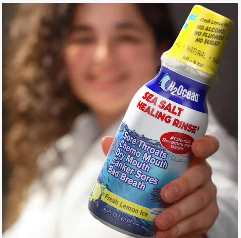
H2Ocean Healing Rinse Mouthwash

What Sets H2Ocean's Healing Rinse Apart for DSOs?- H2Ocean's Healing Rinse is not just a mouthwash, it's a comprehensive post-op care solution designed to meet the unique needs of DSOs. Here's why it stands out: