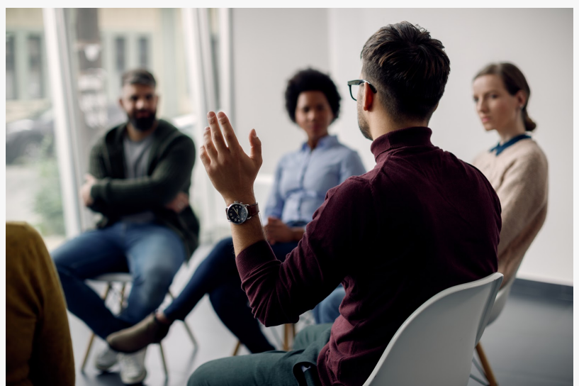
Outpatient Drug Rehab in San Diego