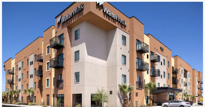
Exterior of WaterWalk Phoenix North Happy Valley

EINPresswire.com/ -- WaterWalk is pleased to announce the successful sale of its WaterWalk Phoenix North Happy Valley location to Ignite Hotels LLC. This transaction marks a significant milestone as WaterWalk Holding Company's first asset sale, highlighting the growing strength and success of the WaterWalk Extended Stay by Wyndham brand.