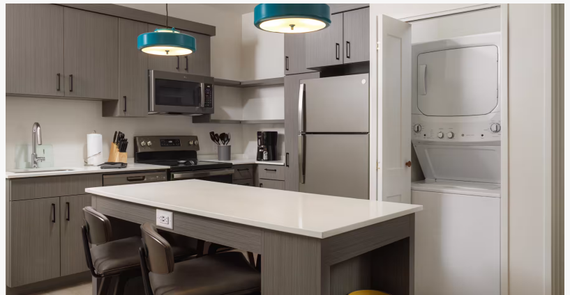
WaterWalk Phoenix North Happy Valley Kitchen