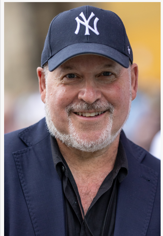
American Composer Frank Wildhorn Celebrates 3 of His Musical's Opening Within A Week In Seoul, Another On Stage by Start of 2025 & World Premiere of Van Gogh In Love Just Announced

Wildhorn, known for his emotionally resonant scores and unforgettable melodies, has cultivated a deep connection with Korean audiences. The national newspaper Chosun Ilbo describes Wildhorn as "An American man who knows how to shake the hearts of Korean audiences better than any other Korean composer" and The Korea Herald recently called him "one of the most beloved composers" while reporting that Wildhorn has played "a critical role in elevating the status of musicals here to mainstream entertainment." The reporter added that Wildhorn seems to have "inyeon," a Korean word meaning "fateful link or connection" with the audiences. His music transcends linguistic and cultural boundaries, touching the hearts of people from all walks of life. "My primary aspiration has always been to compose music that resonates