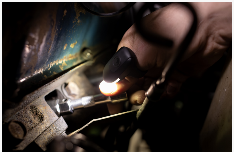
DEX FINGERLIGHT Fits in Tight Spaces