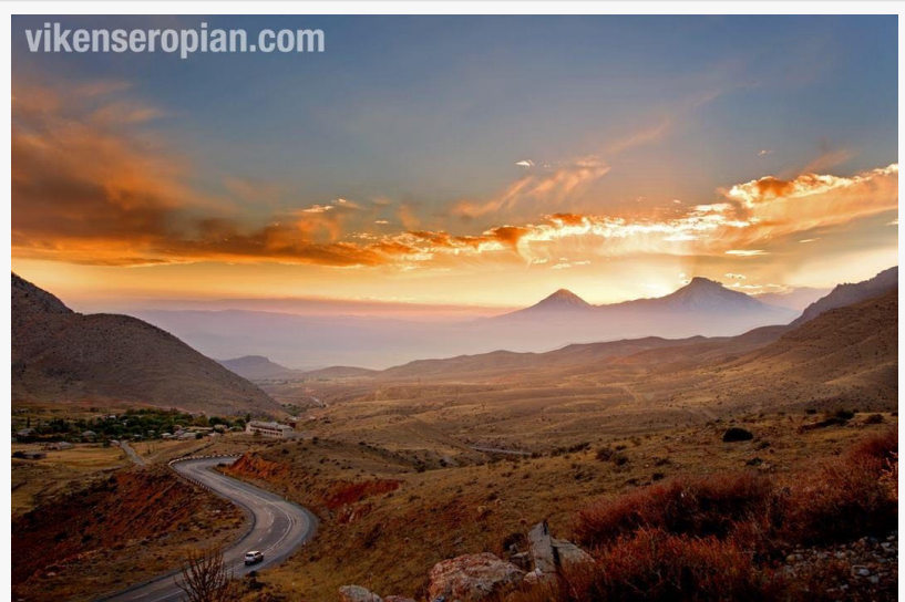
The Road to Vayots Dzor with Ararat in The Back