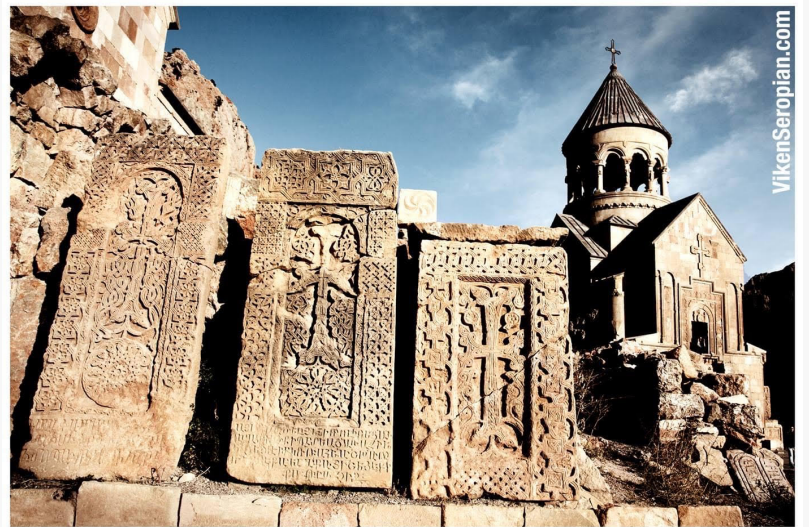
Noravank Monastery: Vayots Dzor Region

This press release can be viewed online at: https://www.einpresswire.com/article/769532467