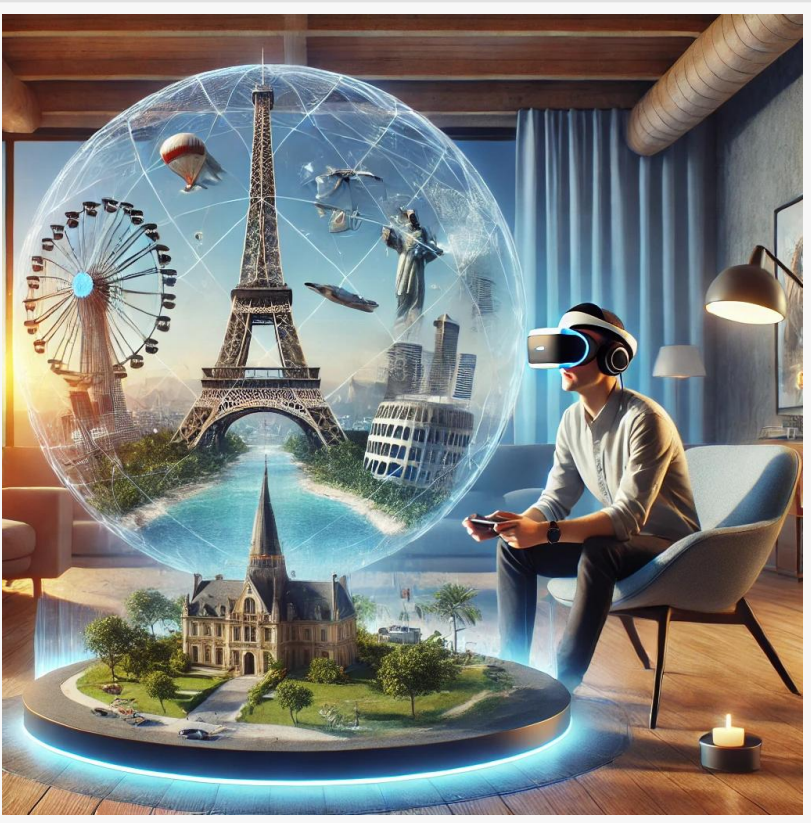
A person wearing a VR headset sits in a modern living room, immersed in a virtual globe showcasing iconic landmarks like the Eiffel Tower and Statue of Liberty, symbolizing the power of OPIC Technologies' 3D livestreaming to transform travel experiences.

The rise in VR headset ownership is accelerating the adoption of virtual experiences. In 2023 alone, over 10 million VR headsets were shipped globally, with devices like Meta Quest and Apple Vision Pro leading the charge. These technologies have enhanced the quality of virtual experiences, offering high-resolution