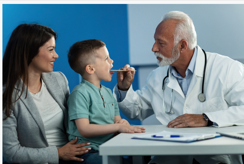
best Children ENT Specialist