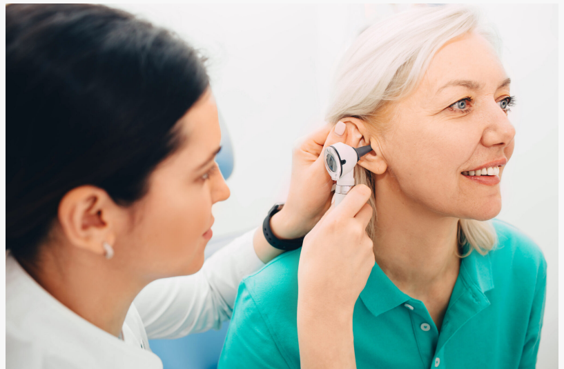
ENT Specialist Northamptonshire