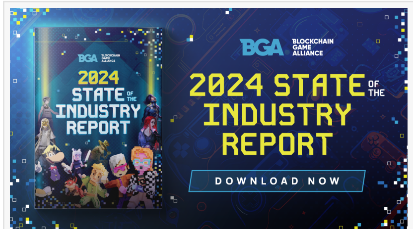
DOWNLOAD NOW: Blockchain Game Alliance (BGA) 2024 State of the Industry Report

Now in its fourth year, the report contains findings drawn from an industry-wide survey of blockchain gaming professionals to gain a yearly snapshot of the industry's condition, advancements, and trajectory. In 2024, the report also confirmed that digital asset ownership continues to be the biggest benefit of integrating blockchain technology in games, according to