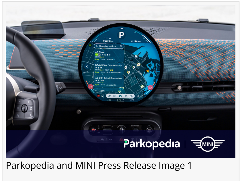
Parkopedia and MINI Press Release Image 1

EINPresswire.com/ -- Latest MINI media system best showcases the new streamlined EV charging experience Unique circular screen makes the typically challenging charging process enjoyable for MINI drivers thanks to integration with Parkopedia System makes it easy to find and verify desired charging sessions from within the vehicle