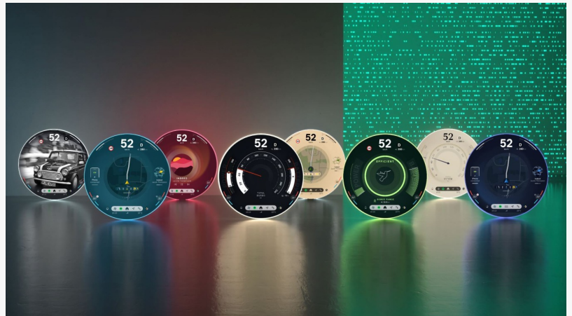
Parkopedia and MINI Press Release Image 3