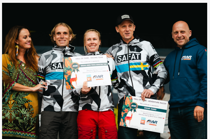
Swedish Armed Forces Adventure Team in the ARWS Hall of Fame

Profiles of the Hall of Fame members will be added to the ARWS website roll of honour shortly, joining those already included at the past two World Championships.