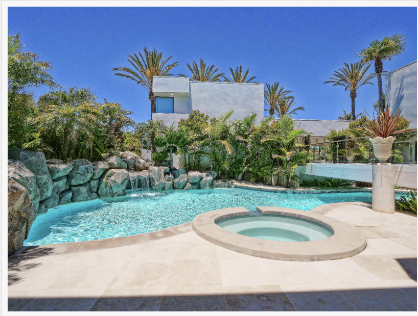
Resort-style pool, spa, and multiple entertaining spaces

The estate's outdoor spaces feature a resort-style pool and spa, a tranquil reflection pool, and a spacious deck with glass railings, perfect for relaxation or entertaining. Lush landscaping, including limestone pathways and fruit trees, creates a