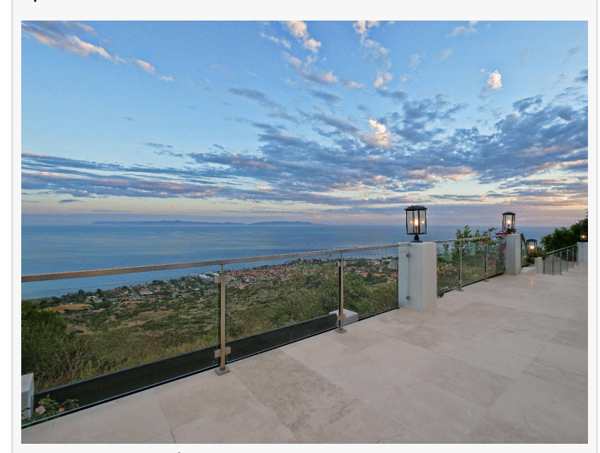
Exquisite 180-degree ocean views

private sanctuary that complements the natural beauty of the Palos Verdes Peninsula.