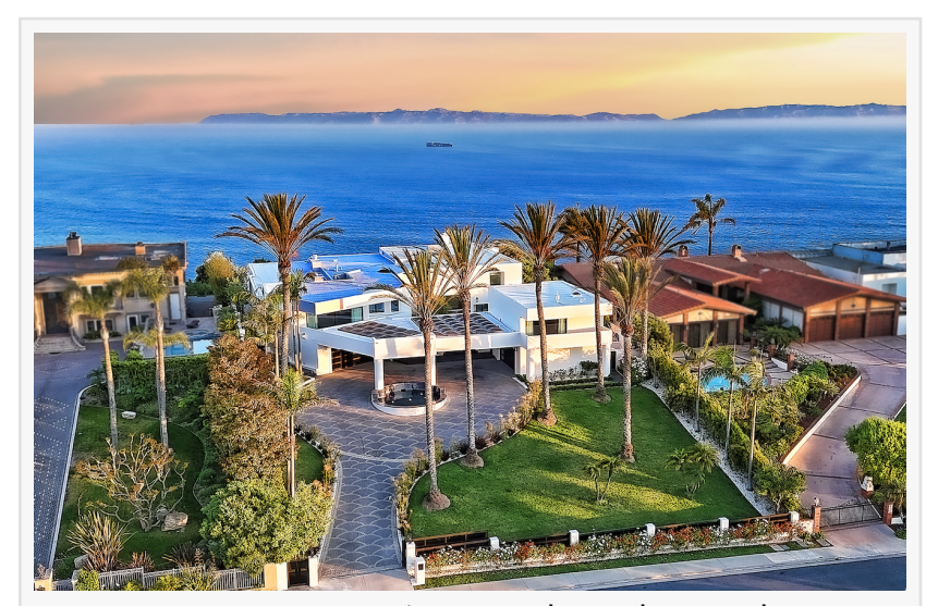
6224 Ocean Terrace Drive, Rancho Palos Verdes, California

The home features a striking circular driveway, porte-cochere, and steel