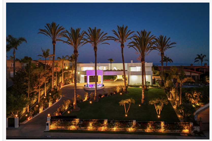
Perched along the picturesque Palos Verdes Peninsula

For more information, including property details, diligence documents, and more, visit ConciergeAuctions.com or call +1.212.202.2940.